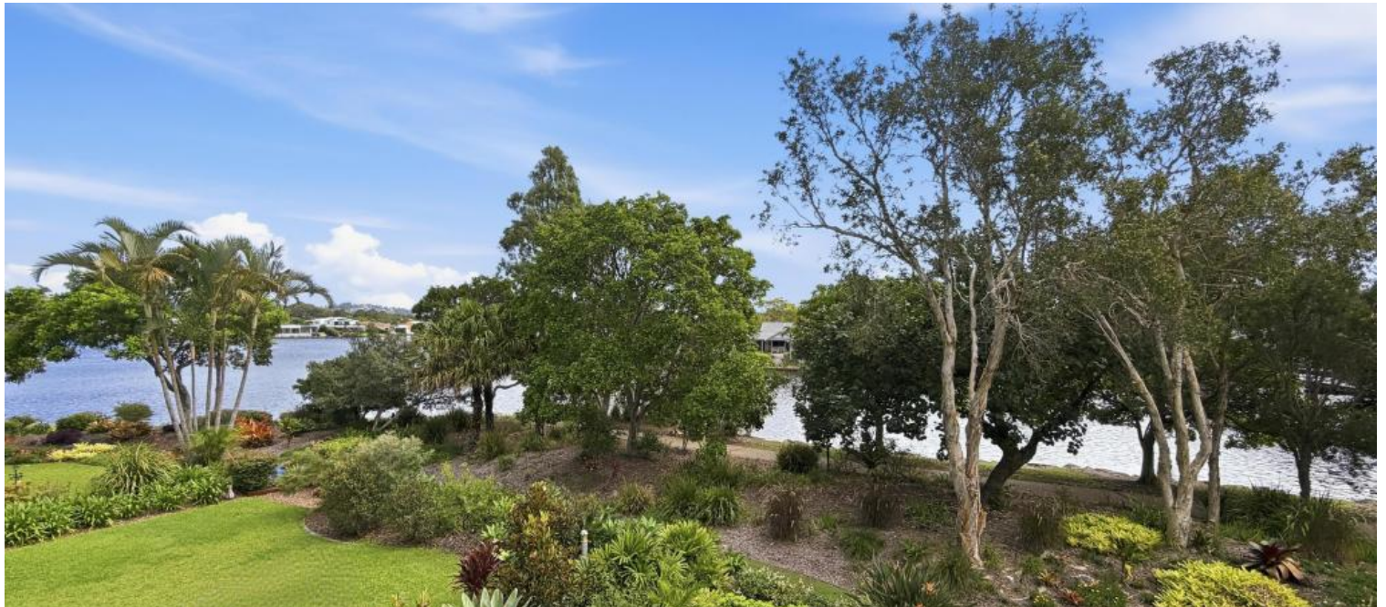
Unit 8, 20 Baywater Drive, Twin Waters