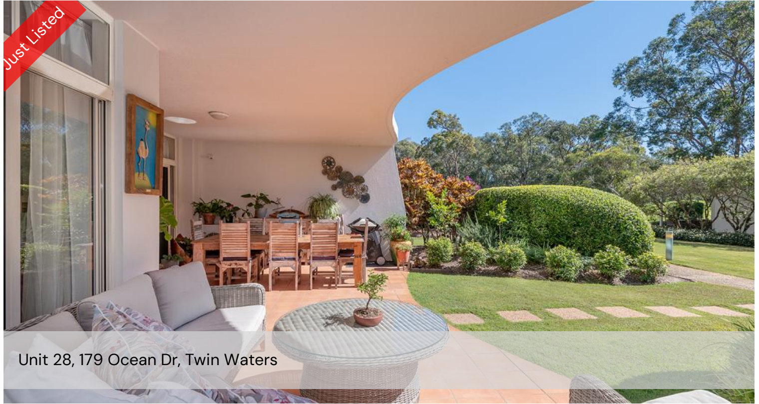
Unit 28, 179 Ocean Dr, Twin Waters