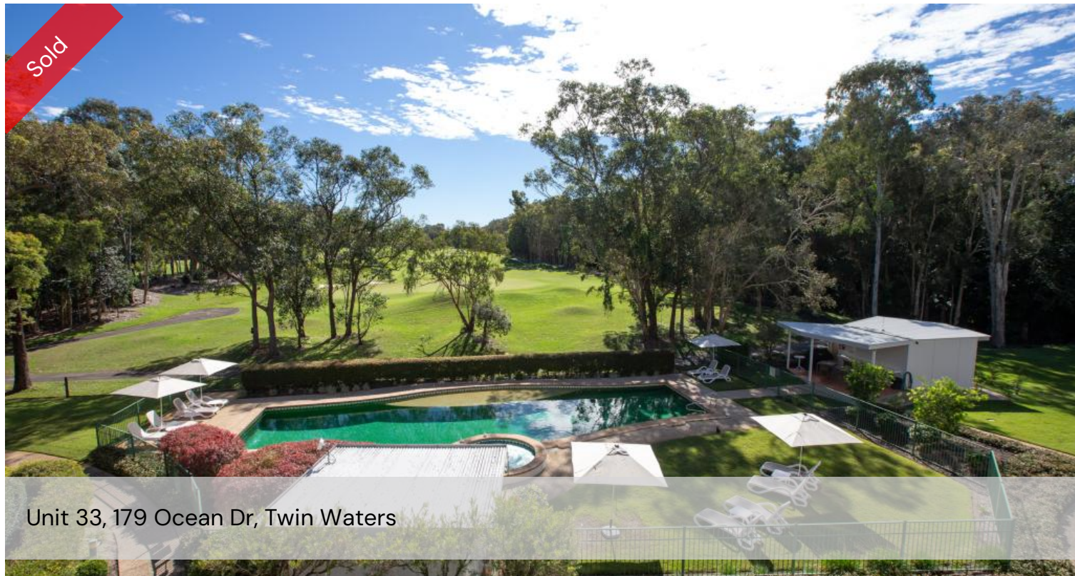
Unit 33, 179 Ocean Dr, Twin Waters