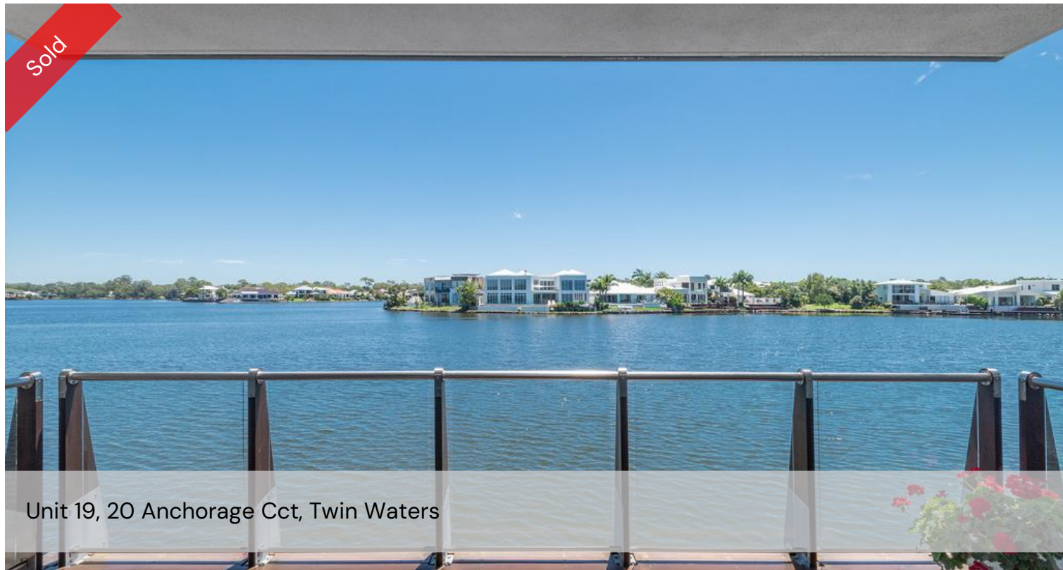
Unit 19, 20 Anchorage Cct, Twin Waters