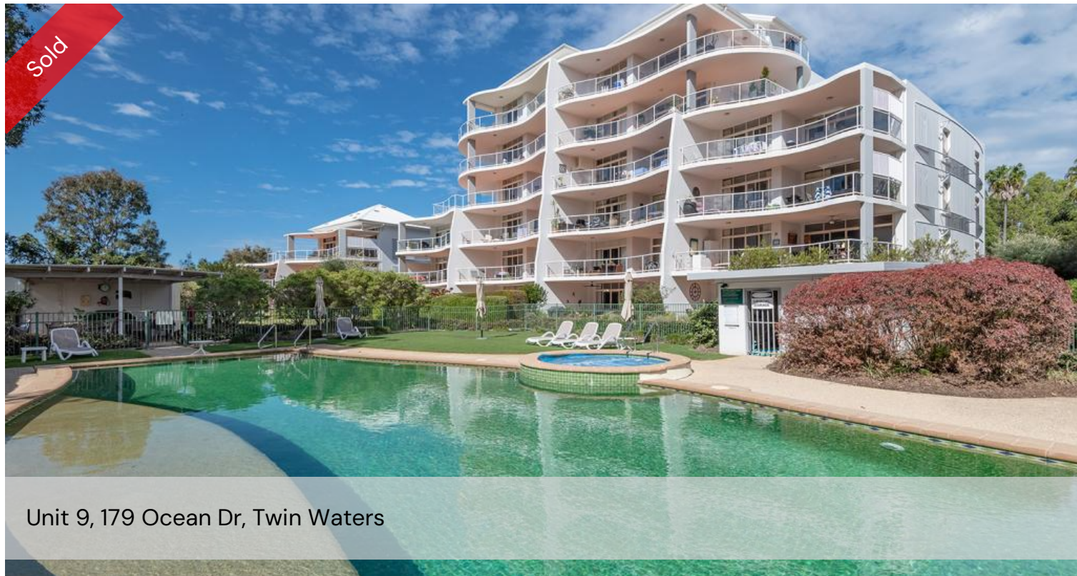
Unit 9, 179 Ocean Dr, Twin Waters