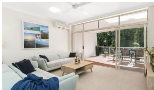
Unit 4, 179 Ocean Dr, Twin Waters