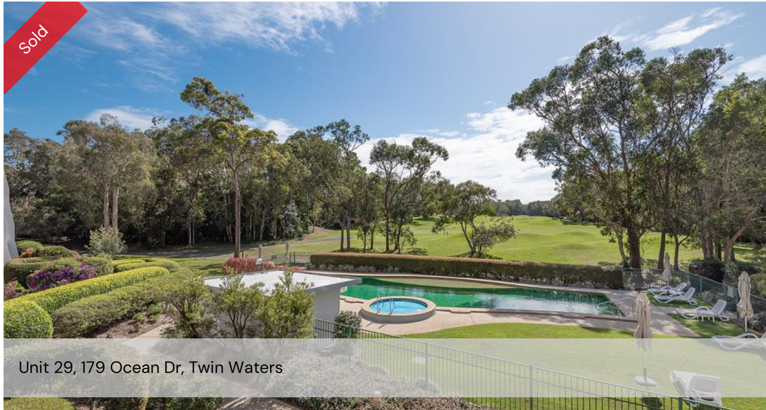
Unit 29, 179 Ocean Dr, Twin Waters