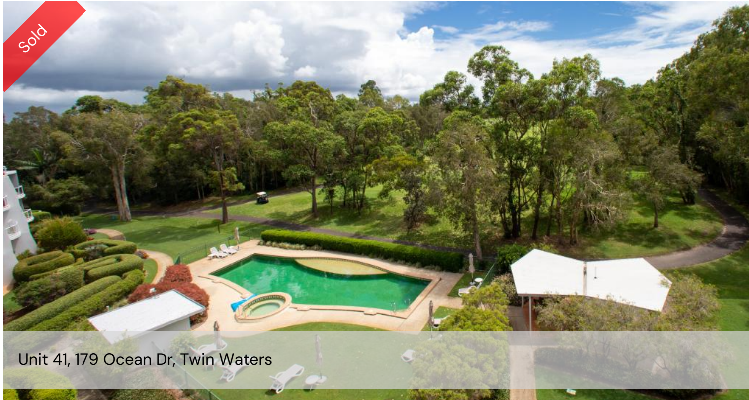
Unit 41, 179 Ocean Dr, Twin Waters