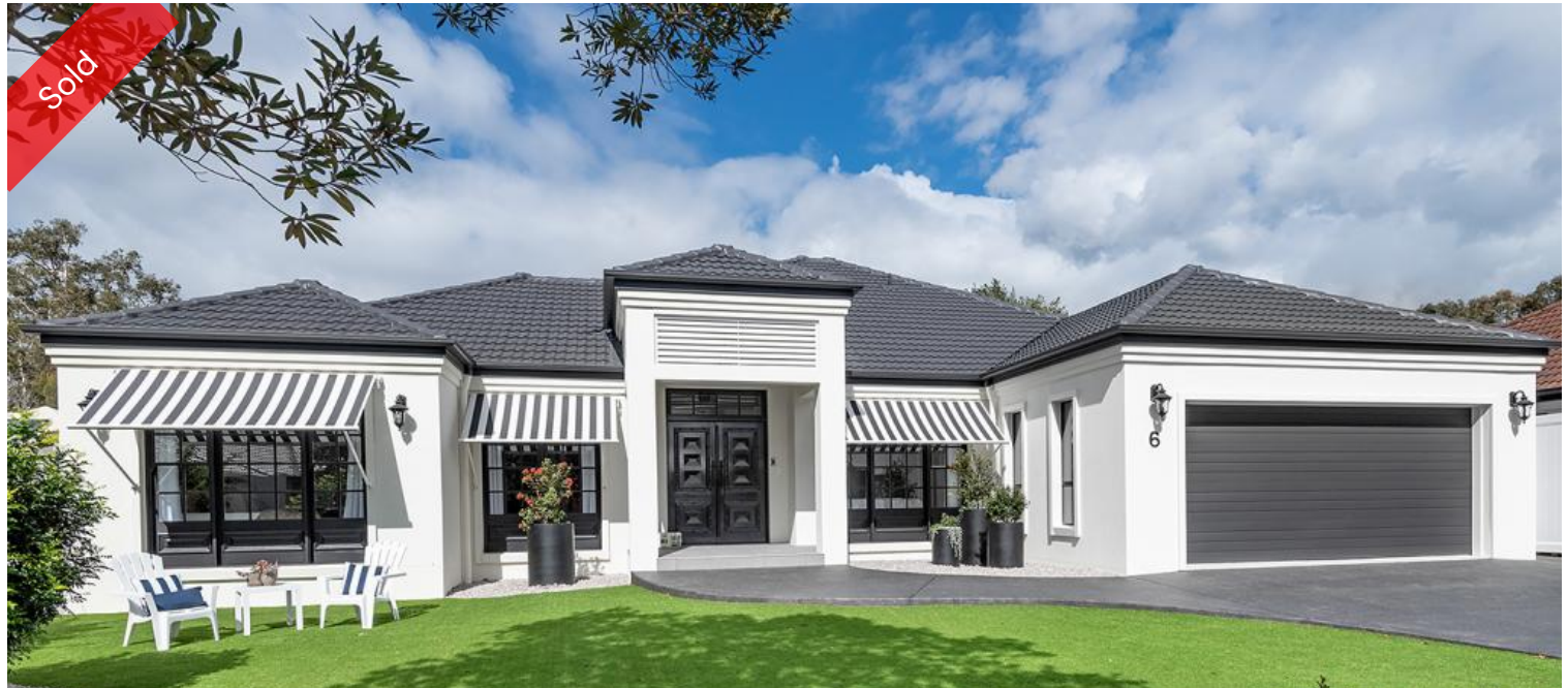
6 Portmarnock Ct, Twin Waters