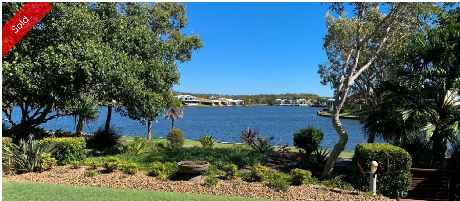
Unit 5, 20 Baywater Dr, Twin Waters