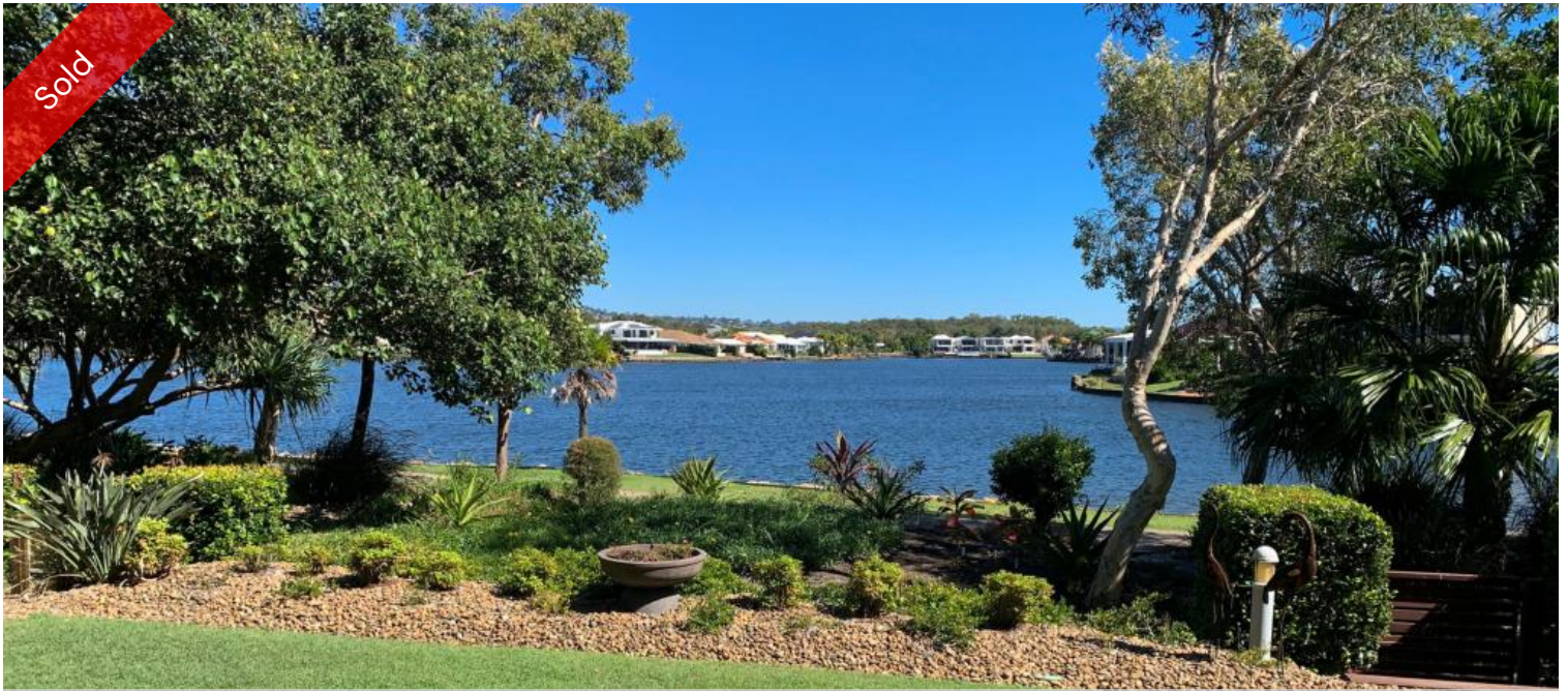
Unit 5, 20 Baywater Dr, Twin Waters