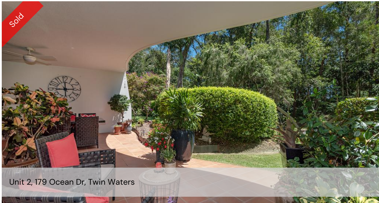
Unit 2, 179 Ocean Dr, Twin Waters