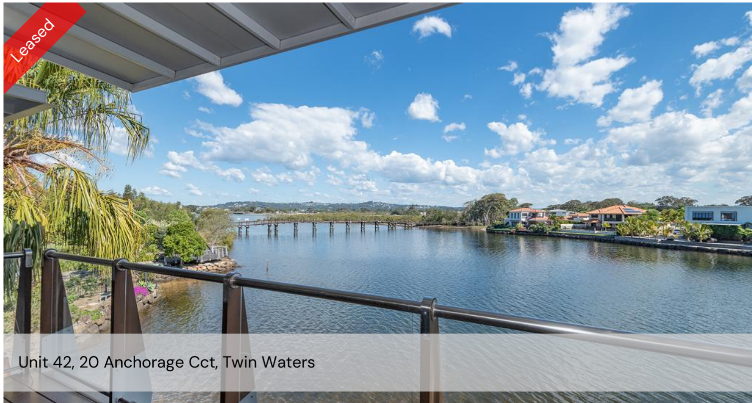
Unit 42, 20 Anchorage Cct, Twin Waters