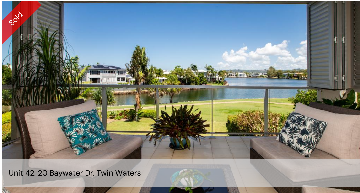
Unit 42, 20 Baywater Dr, Twin Waters