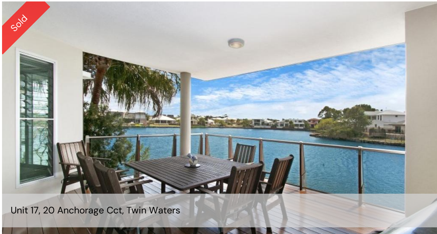
Unit 17, 20 Anchorage Cct, Twin Waters