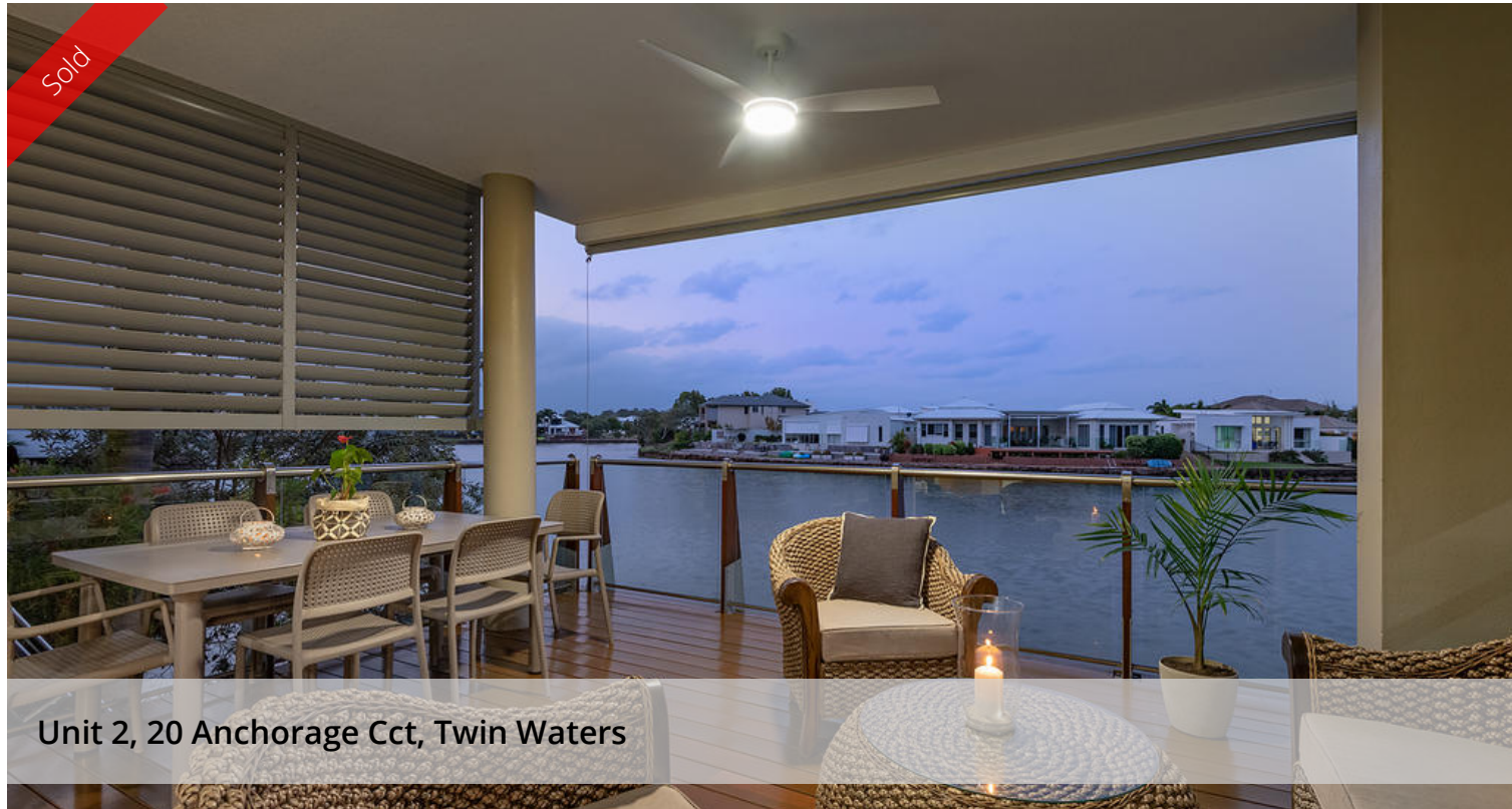
Unit 2, 20 Anchorage Cct, Twin Waters