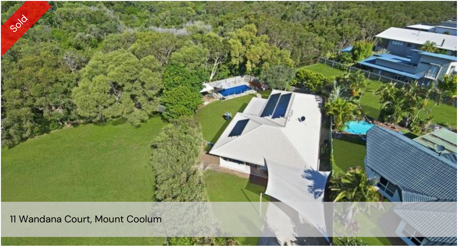
11 Wandana Court, Mount Coolum