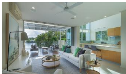
Unit 6, 20 Anchorage Cct, Twin Waters